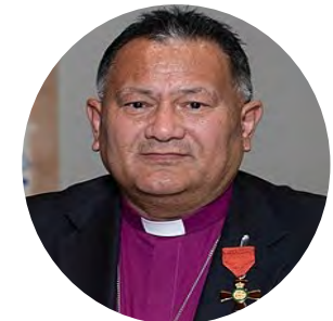
Bishop Te kito Pikaahu ONZM