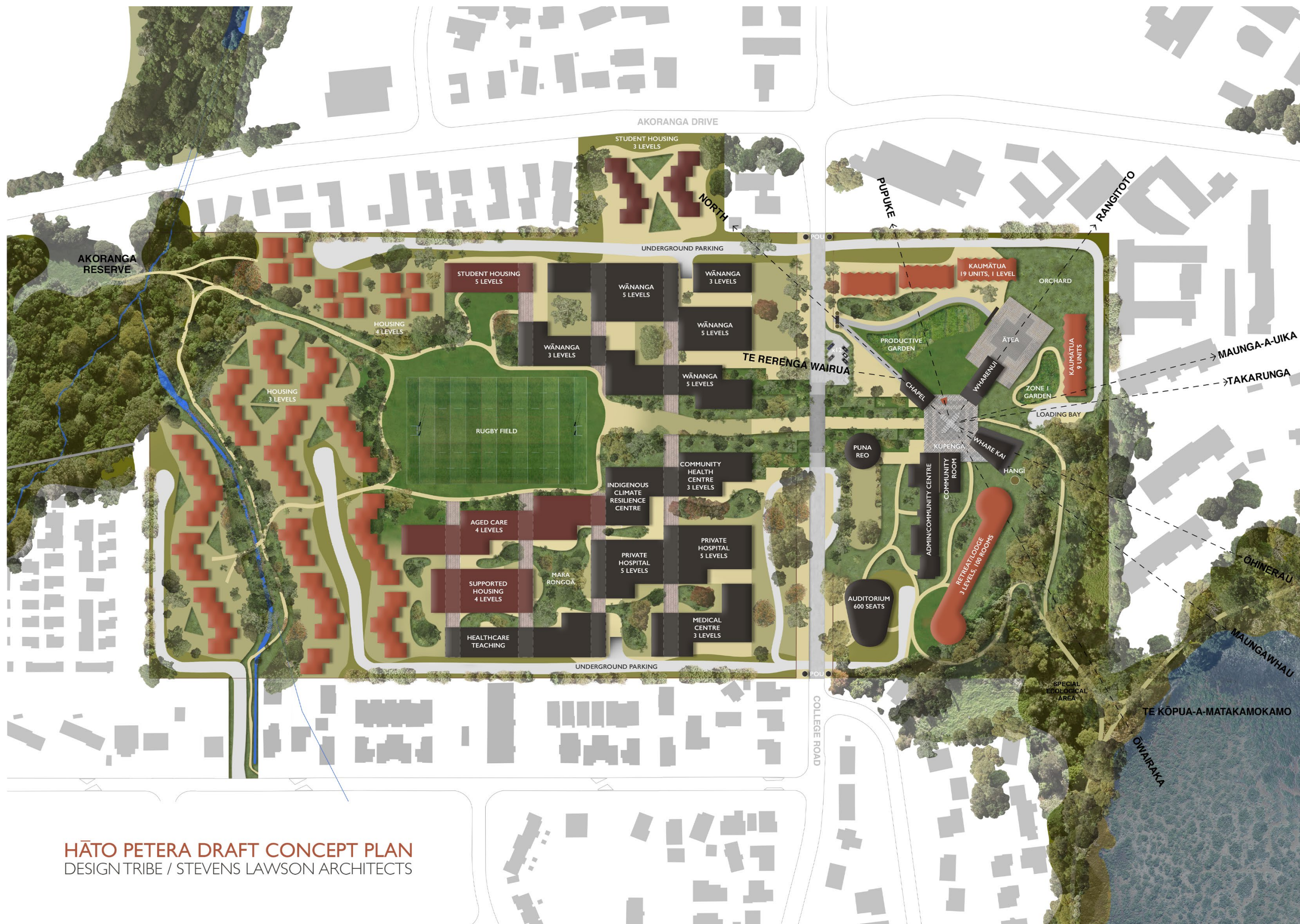
HĀTO PETERA DRAFT CONCEPT PLAN DESIGN TRIBE / STEVENS LAWSON ARCHITECTS