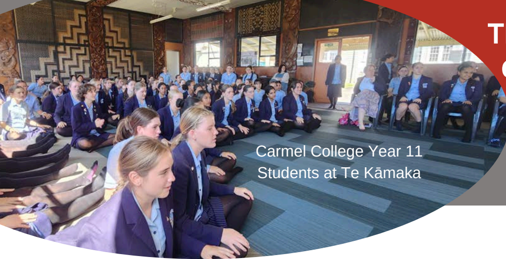
Carmel College Year 11 Students at Te Kāmaka

Follow Te Kamaka Committee Marae on Facebook [Search Te Kamaka Marae Committee]